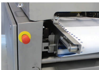
Single T-handle allows for infinite adjustments for proper skinning