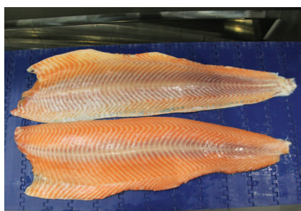
From silver skinning to deep skinning