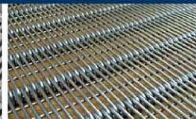
Stainless Steel Mesh Belt