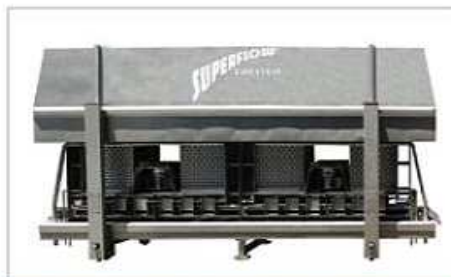
Hoistable Cover for Easy Access & Cleaning