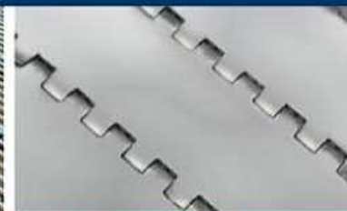
DTZ Flat Modular Stainless Steel Belt