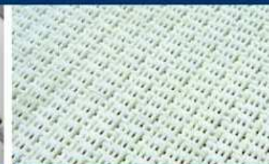
Plastic Modular Belt