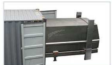
Factory Assembled to fit a 40' Container