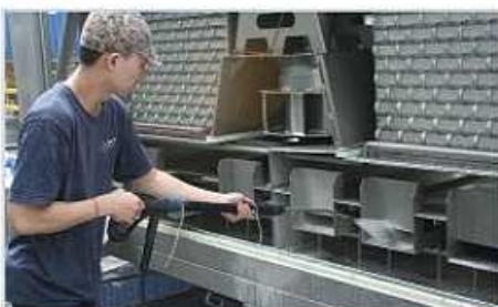
Open Design for Easy Cleaning