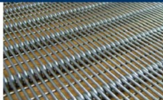
Stainless Steel Mesh Belt