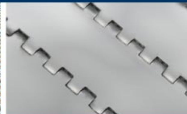
DTZ Flat Modular Stainless Steel Belt