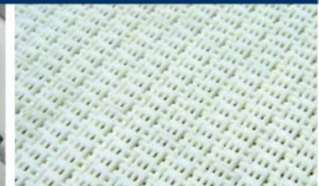
Plastic Modular Belt