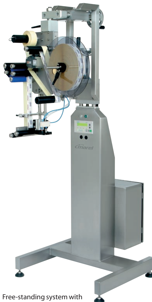
Free-standing system with Concept A500 applicator.

The comprehensive, user-friendly control module enables the operator to easily set conveyor speeds and label positions. Information can be entered on the screen and, when running, the system operates in a diagnostic mode.