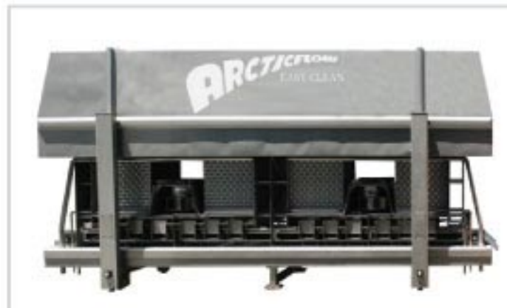
Hoistable Cover for Easy Access & Cleaning