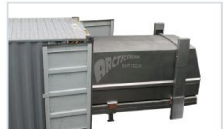
Factory Assembled to fit a 40' Container