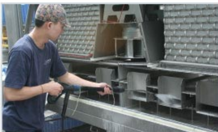
Open Design for Easy Cleaning