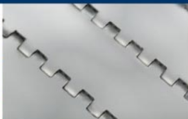
DTZ Flat Modular Stainless Steel Belt