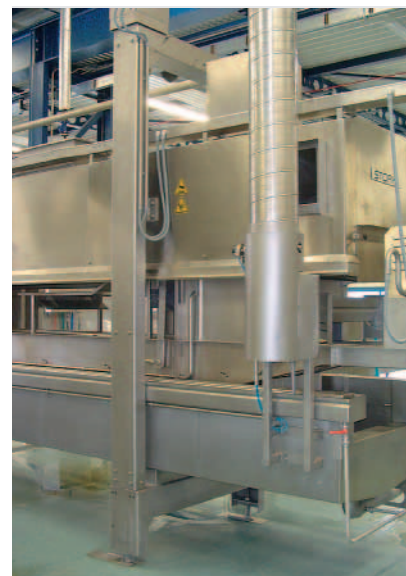
Cleaning of the LinearOven is easy, efficient and quick.