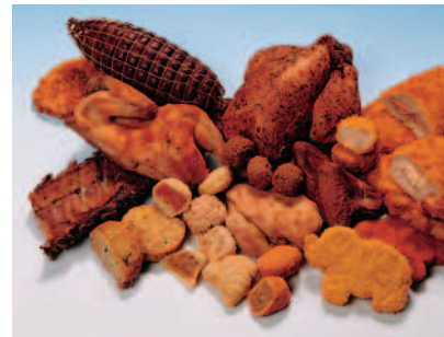
Result of the LinearOven: a steady flow of uniformly high quality products.