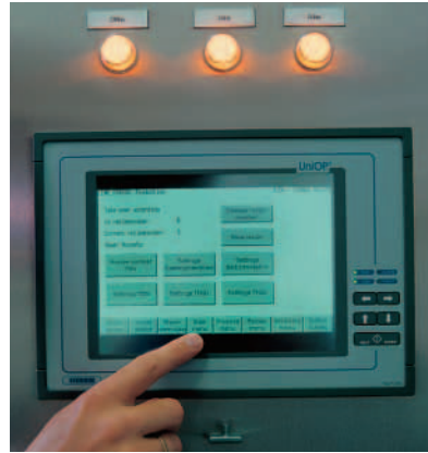
Operation of the oven is by means of a menu on a touch screen.

LinearOven makes for excellent process management, particularly when it comes to setting temperatures, air speed and air humidity. Depending on the respective settings of these parameters, products are exposed to a steaming, cooking or grilling process. Operation of the oven is by means of a menu on a touch screen. This touch screen is on a control panel sited remotely from the LinearOven. You can therefore control the whole LinearOven process from a single location.