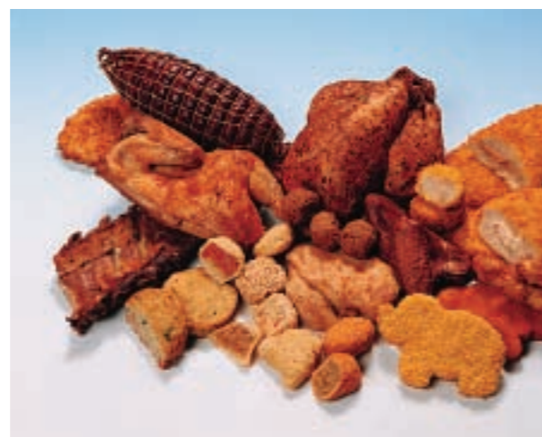
Result of the LinearOven: a steady flow of uniformly high quality products.

Each section has a heating element, which transfers heat to the air. The air then conducts this heat right into the product. Air is sucked in once more by the fans creating not just a closed circulation but also an underpressure at both entry and exit to stop the egress of too much steam when steaming.