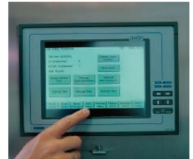
Operation of the oven is by means of a menu on a touch screen.

It is not only chicken, chicken fillets and bone-in products that can be steamed, cooked or grilled particularly efficiently in LinearOven. The oven is also extremely suitable for the cooking of formed products such as burgers, nuggets and composite products like Cordon Bleu. It will handle red meat products such as spare ribs, roast beef and sausages too.