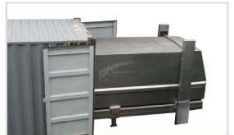
Factory Assembled to fit a 40' Container