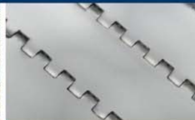
DTZ Flat Modular Stainless Steel Belt