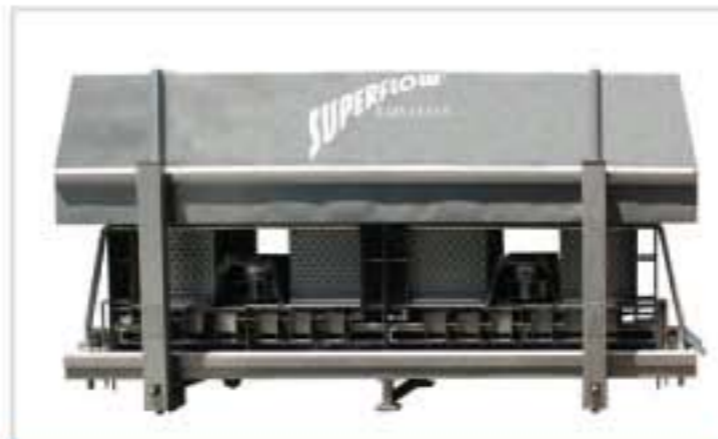
Hoistable Cover for Easy Access & Cleaning