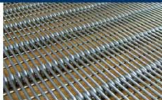
Stainless Steel Mesh Belt