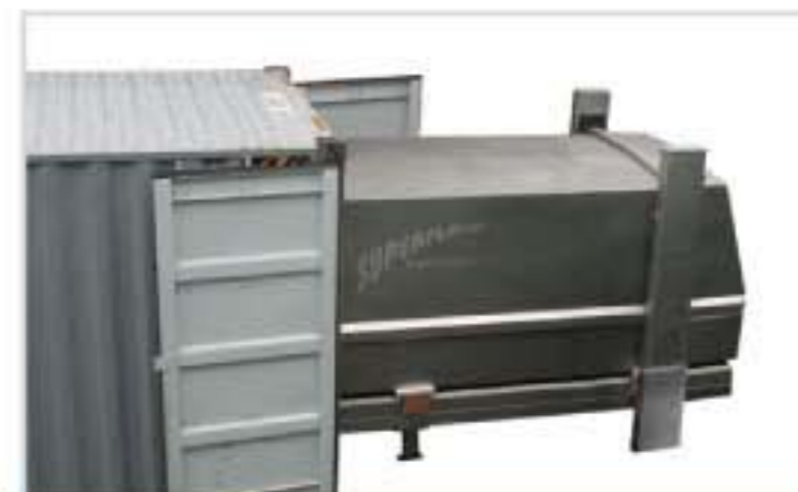
Factory Assembled to fit a 40' Container