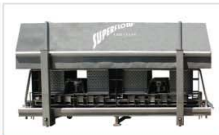
Hoistable Cover for Easy Access & Cleaning