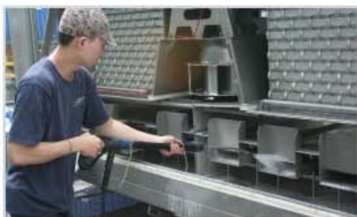
Open Design for Easy Cleaning