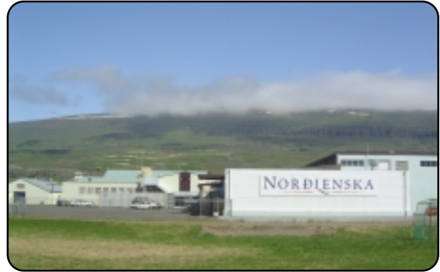
Norðlenska ehf headquarters in Akureyri, Iceland.