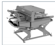
SmartSplitter Slices poultry fillets horizontally into portions of desired height.