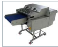
SK 15-340 Conveyorized Belly Skinner Automatically skins pork bellies at high yields.