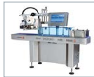
9000 Weigh Price Labeller Precision weigh price labeling at speeds up to 60 packs/min.