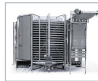
ArcticFlow Freezers Rapid and uniform freezing at great savings in energy consumption.