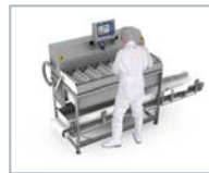
TargetBatcher Provides accurate fixed-weight batches of fresh and frozen products.