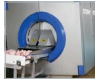
ValueDrum Tumbler for in-line production of coated or marinated fresh products.