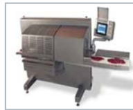
I-Slice 1068 VA For intelligent slicing of meat. Fixed weight with high accuracy.