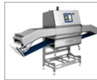
Sensor X with Separator Advanced X-ray technology provides a safer, more valuable product.