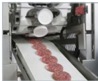
MasterFormer Low-pressure former for filled or unfilled products. Homemade look.