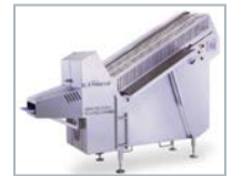
PolySlicer 1000 Accurate slicing. High throughput. Wide range of presentation formats.