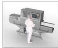
I-Cut 10 PortionCutter Speed and versatility saves labor. Improved yields mean rapid payback.