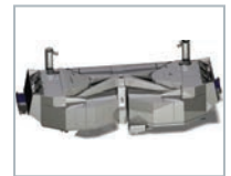
ModularOven System Two completely separated cooking environments for maximum control.

Call your Sales Representative and make reservations now: 1-888-888-9107