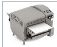
Platino Flattener Flattens meat products to up to four times their original size.