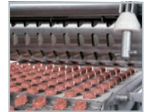
RevoPortioner Perfectly portioned products at low pressure. Low ownership cost.