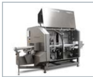
I-Cut Portion Cutters High-speed portion cutting to fixed weight and/or length.

We've waited patiently for an opportunity to show off all of our exciting and most innovative products for 2011 and beyond. Now, we're taking matters into our own hands. See the best of Marel: