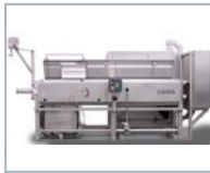
DMM 10 Meat Harvester Harvests quality 3 mm ground meat from bones of pork, beef and lamb.