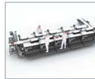
StreamLine Meat Innovative trimming line that enables monitoring and data collection.