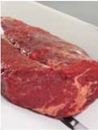
Scanning of the meat prior to cutting enhances accuracy