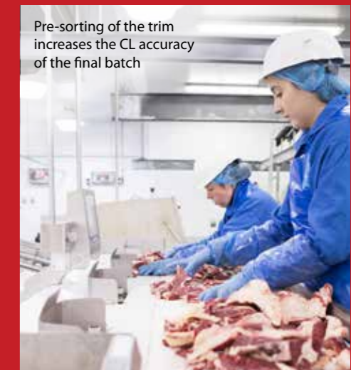
Pre-sorting of the trim increases the CL accuracy of the final batch