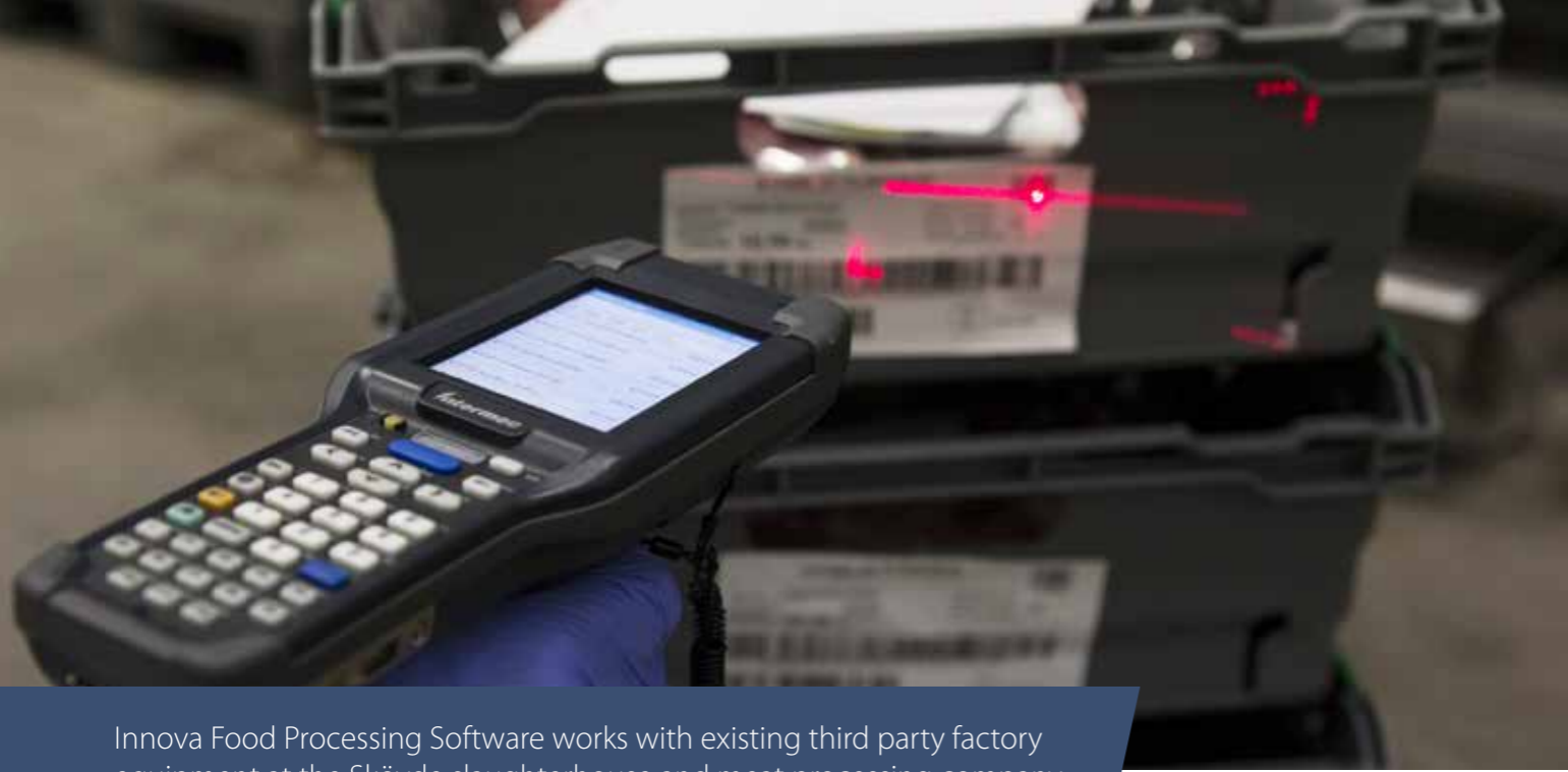
Innova Food Processing Software works with existing third party factory equipment at the Skövde slaughterhouse and meat processing company.